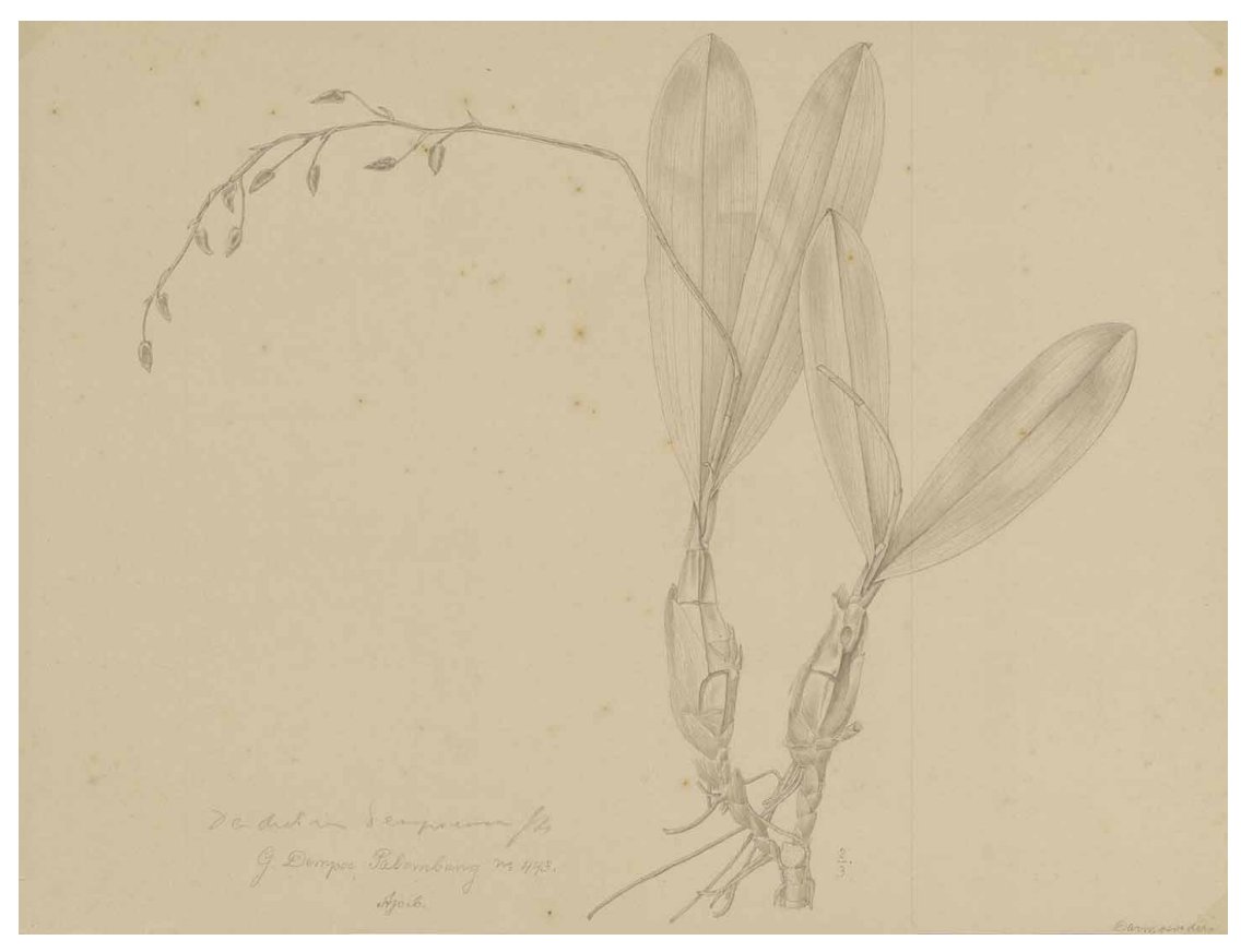
An illustration by an unknown person